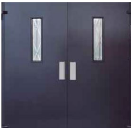
Manual swing landing door (standard)